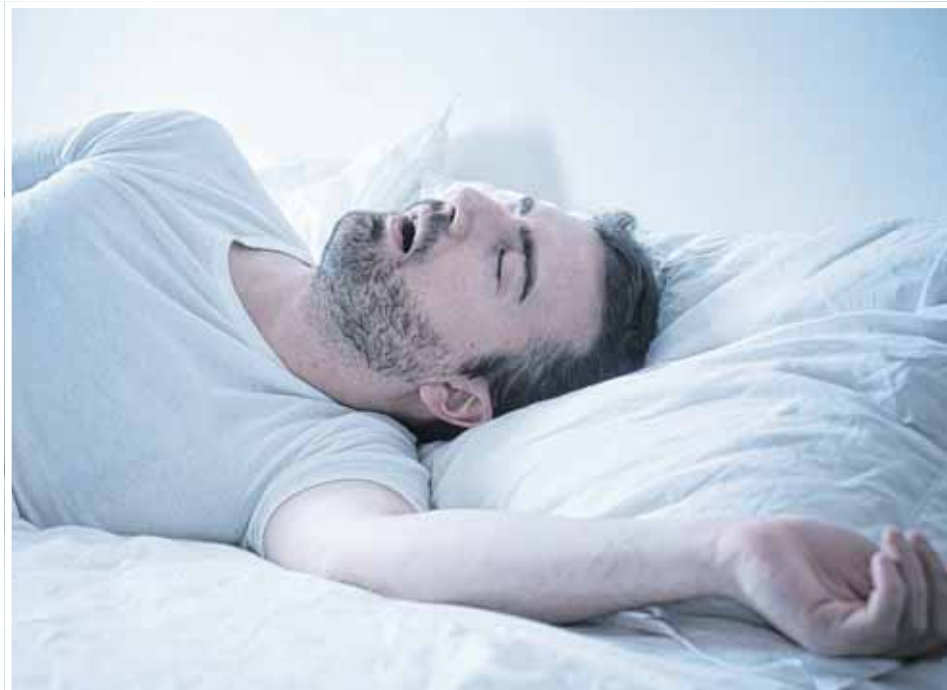
SNORER: Snoring can be a telltale sign of sleep apnoea, but dental appliances can help alleviate this problem.

At Michelson's Dental Surgery, they work