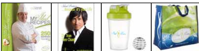
My Ideal Recipes