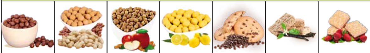
Chocolate Soy Puffs