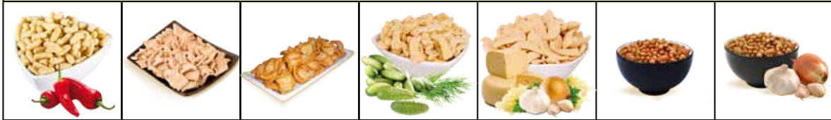
Southwest Cheese Curds